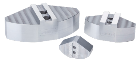
Aluminium clamping jaws