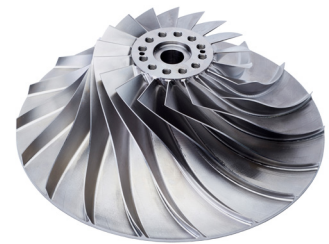
Impeller 5-axis simultaneous milling